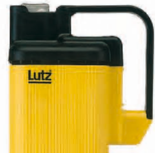
Illustration shows: pump tube SS with motor MA II

Accessories hose connection see page 109